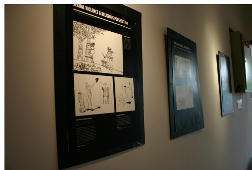
Marzuki Darusman visits exhibition on Serious Human Rights Violation in North Korea

During his visit to see the documentation exhibition, Mr. Marzuki Darusman also explained further about the poor condition in North Korea such as the problem of hunger, malnutrition, as well as the poor condition of the political prisoners in prisoner camps.